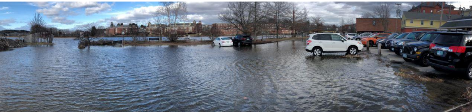
Photo: Flooding at Exeter Town Landing March 2018 Nor'easter